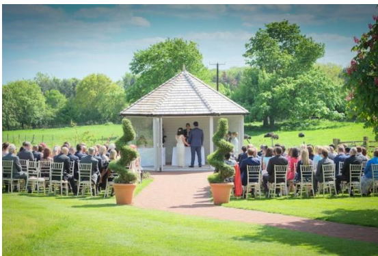
The Garden Room

Prices are exclusive of VAT - E&OE. The Wedding package is for a minimum of 50 adult guests and is excluding bank holiday Sundays and Mondays. Additional all-day guests are charged at £40 per person. The first 10 children (aged 3-12) are charged at £20.00 each, children under 2 years are free of charge unless they require food which is £10 each and high chairs can be provided. Additional evening guests are charged at £8 per person. See Venue Hire for Civil Ceremony fees.